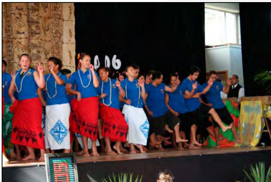
Te Kura Taumata o Panguru.

The event was supported and organised by Te Oranga who also gives the opportunity for our youth to take on the role of organising and managing events such as this one, within the organisation. This group we call the E.M.G. (Events Management Group). Also to Students who had the role of being MCs for the day were awesome and just highlights the talents we have within our rohe. Nga mihi nui kia koutou nga Taurira.