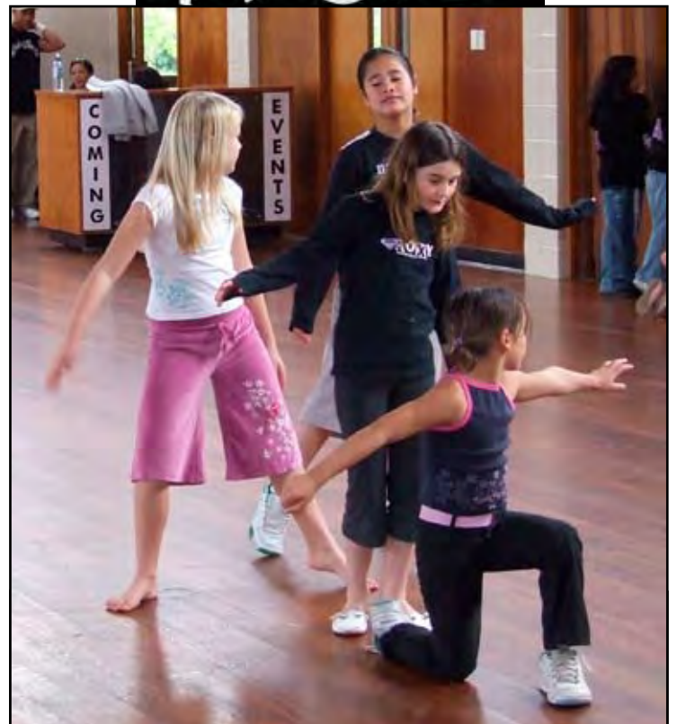
Creating a routine...

Elite Hip Hop dance workshops for youth who are interested in becoming part of a hip hop dance tutorial team will be scheduled for term 3 which will lay the foundation for continued hip hop dance classes in each