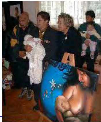
The painting and whanau at the

This is a very relevant health matter for many whanau and a disease that can be managed just through diet and exercise.