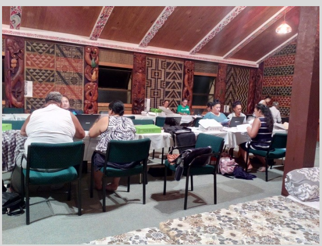
Above: Mahia ngā mahi.

The wānanga programme was specifically developed to provide practical examples for local communities in the construction of historical accounts, booklets, pamphlets, whānau histories, whakapapa, church jubilees, school