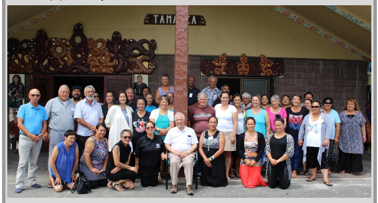
Below: Wānanga participants

projects, and tertiary level assignments. It began with a special ceremonial karakia and blessing of akonga and after an introduction to the Latin language, akonga were given their module tasks for the next two days. After this the most difficult mission was to drag them away from the tables to eat and sleep.